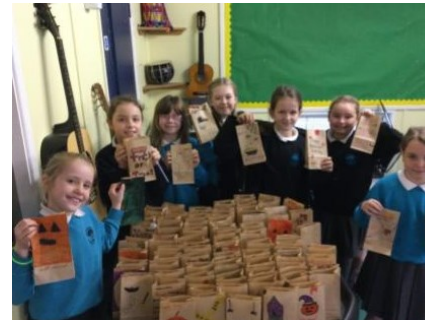
Getting the treat bags ready!!

Young Enterprise set up a Halloween shop for the students of Cranmore on the last day of term. The children worked hard in the run up to the event to make sure their products were ready, as well as enduring a 'shift in the shop' – serving the droves of hungry pupils! Young Enterprise would like to thank everyone for their contributions in making the event a success. We raised over £400 for our school. We look forward to doing it all again at the Christmas Fair!